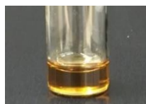
【Fig. 1 : sample】

* Safety Data Sheet information: contains mineral oil, polyolefin amide alkene amine and Molybdic acid special mixed amine salt.